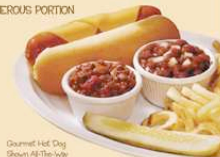
Gourmet Hot Dog Shown All-The-Way

Our Burgers and Steaks can be cooked to order. Consuming raw or undercooked meats, fish, shellfish or fresh eggs may increase your risk of food-borne illness, especially if you have certain medical conditions