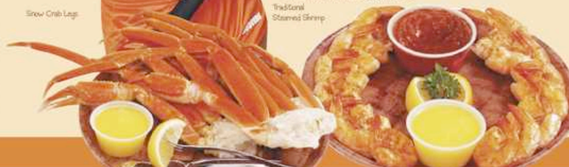
Snow Crab Legs