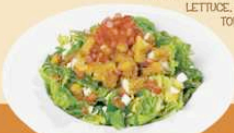
Hooters Cobb Salad